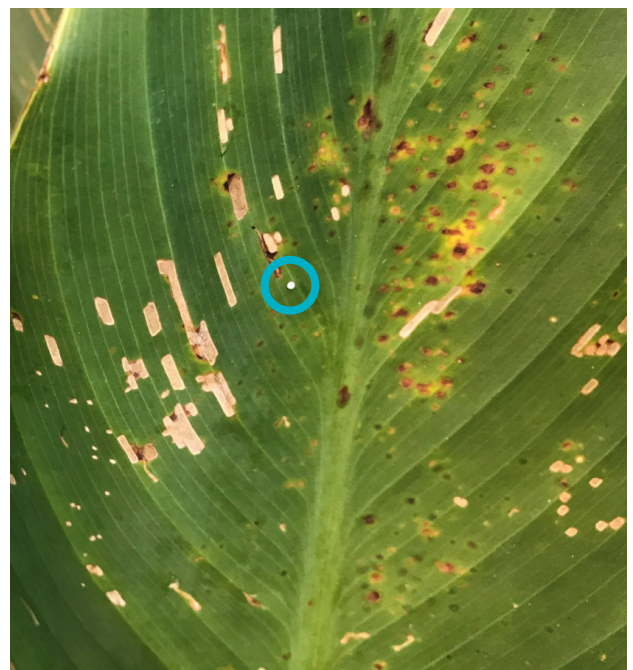
Figure 2. Larger canna leaf roller egg on a leaf.

The eggs are about 1 mm in diameter and are visible by the naked eye (Figure 2). Pale green colored eggs are laid singly on the upper and lower leaf surface of canna. Sometimes, several eggs can be found on a single leaf. A day after laying, the eggs turn into a pinkish color. A few days later, the eggs hatch. Larvae initially feed on the leaf margin creating a flag leaf (Figure 3A). Then the larva ties the leaf flap with the rest of the leaf using silken strands. A few days later, the larva systematically rolls the entire leaf (Figures 3B and C). The caterpillar feeds within the roll and pushes out the frass pellets (excrement) from the leaf rolls. The leaf roll provides shelter and protection from the sun and natural enemies. The greenish, naked, or transparent larva has a distinctively large head capsule (Figure 4). Initially, the head is black but turns orange with black triangular marks in the later stages (fourth and fifth stage larva) of larval development (Figure 4C). Because the caterpillar feeds on green leaves, the color of the caterpillar appears green. The larvae molt five times before transforming to pale green pupae within the leaf roll.