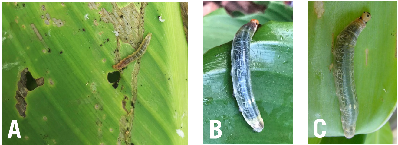
Figure 4. Larger canna leaf roller caterpillar.