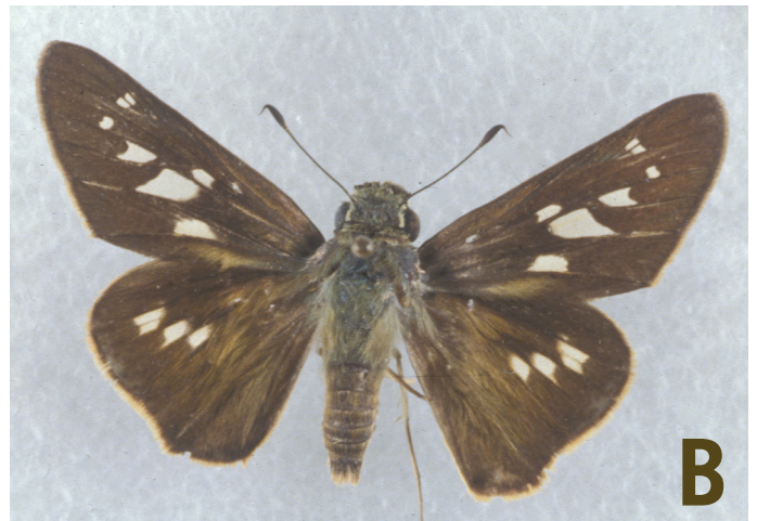
Figure 1. Larger Canna Leaf Roller Butterfly.