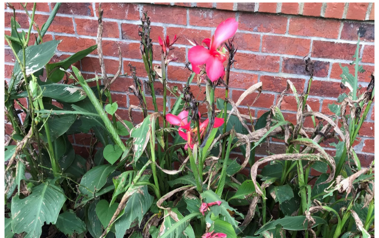
Figure 5. Extensive feeding damage after larger canna leaf roller attack.

LCLR mostly attack plant species within the Cannaceae family. The only other family that LCLR has been found to attack is West Indian arrowroot ( Maranta arundinacea L.). Leaf rolling can cause severe damage to canna plants when most of the leaves are rolled. Any new shoots that emerge from the rhizome are quickly attacked, and plants produce few flowers if not managed. The caterpillars also feed on the emerging flowers (Figure 3D) and the entire plant appears completely beaten and battered (Figure 5).